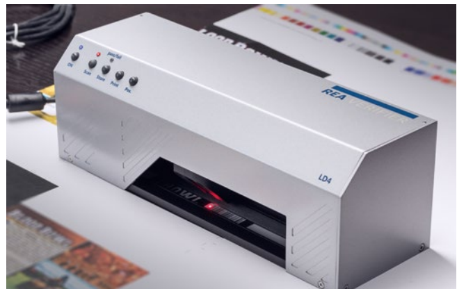
Measurement of printed sheets in production