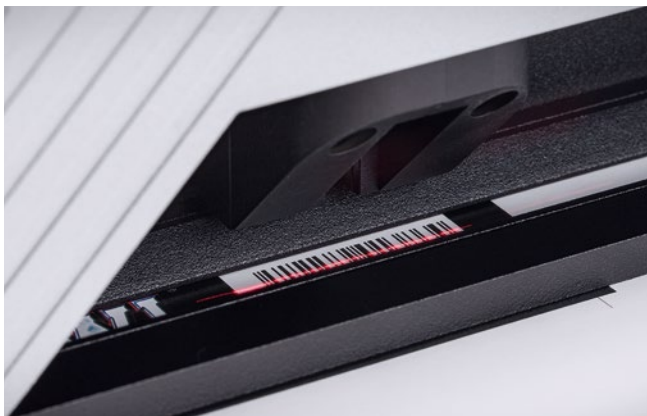
A measurement is carried out